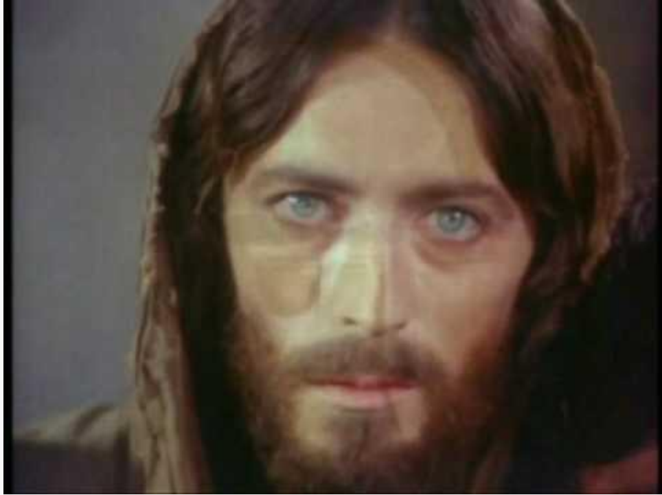
Don Francisco - He's Alive

February 18 at 3:09am · Like · Remove Preview