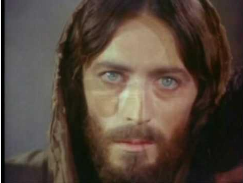
Don Francisco - He's Alive

February 18 at 3:03am · Like · Remove Preview