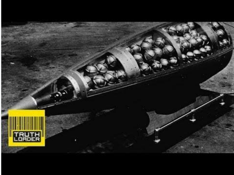
The Five Worst Weapons Still in Use - Truthloader OK, so this one is up for debate, but we've put together a list of the top five... See More