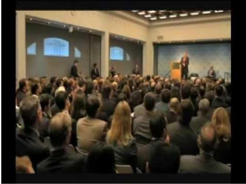
chuck missler & kent hovind VS UFO,atheist,illuminati,NWO,satanic government,THE DIVIDE Trailer 2012 chuck missler & kent hovind VS UFO,atheist,illuminati,NWO,satanic government,THE DIVIDE Trailer 2012

June 21 at 7:09am · Like · Remove Preview