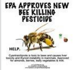
Timeline Photos The EPA approved yet another bee toxic systemic pesticide called cyantraniliprol... See More By: GMO Free USA

June 6 at 2:46am · Like · Remove Preview