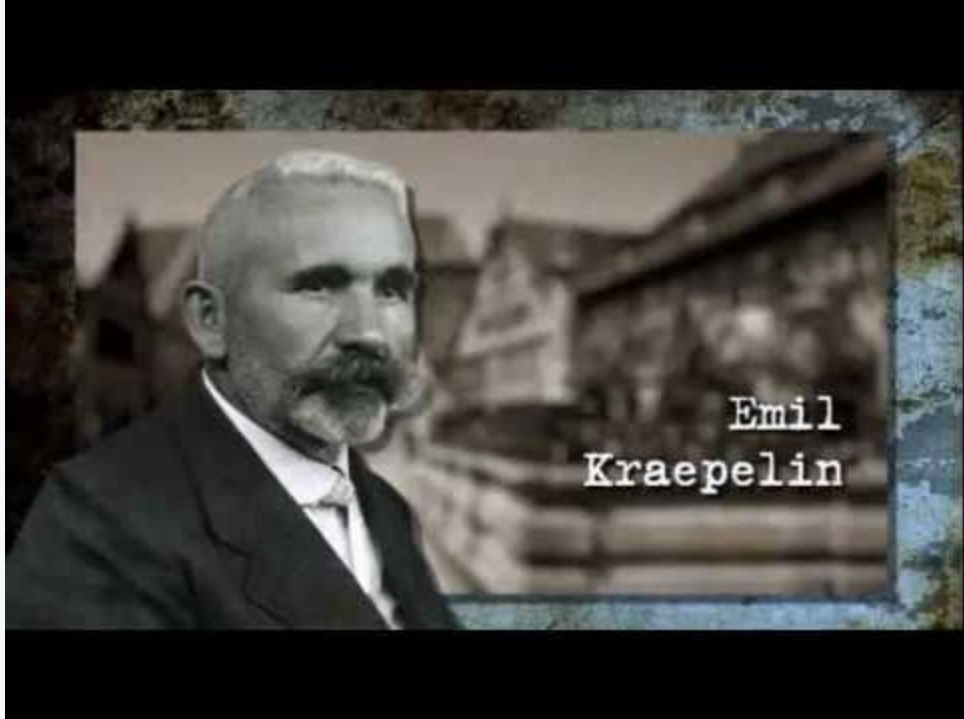
Psychiatry: The Marketing of Madness: Are We All Insane? Download: http://www.archive.org/download/cchr_psychiatry/cchr_maketing_of_madnes... See More

June 5 at 10:19pm · Like · Remove Preview