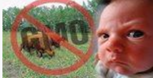
GMO's - 23 Reasons To Avoid Them covha.net GMO Monsanto Let's Face It, There will always be someone who looks at you like [...]

June 5 at 11:17pm · Like · Remove Preview