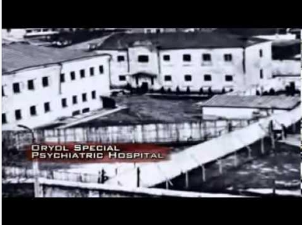
The Most SHOCKING Psychiatry Documentary EVER