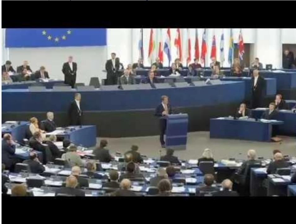
Globalist Conspiracy Plans for the New World Order Exposed (Full Documentary) Globalist Conspiracy Plans for the New World Order Exposed (Full Documentary) ..... See More

Michael Swenson https://www.youtube.com/watch?v=YDe22UD2qe0