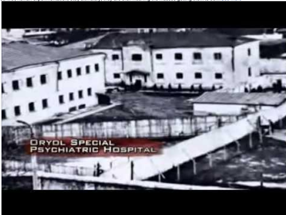
The Most SHOCKING Psychiatry Documentary EVER