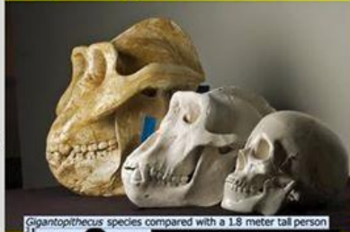
Gigantopithecus species compared with a 1.8 meter tall person

In the past, it had been thought that G. blacki was an ancestor of humans, on the basis of molar evidence; this is now regarded a result of convergent evolution. G. blacki is now placed in the subfamily Ponginae along with the orangutan.