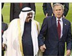
SAUDI PRINCE BROMANCE

The King will support the war because if the price of crude oil goes up to $100 he will be the richest man on earth. He will help get all the other Arabs on board.