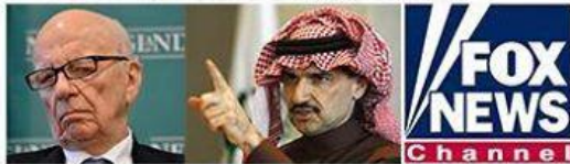
THE MEDIA MANIPULATORS AND OWNERS OF FOX NEWS

Since Fox News is partially owned by the Saudi Prince and Saudi Arabia, Fox News will be the stage to endorse, promote and cheer the war for profit. We will replay every video that will create fear and scare Americans that if they don't go to war they will die. We co-own Fox News and our goal is to manipulate Muslims and Christians in the name of profit.