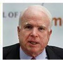
THE IDIOT CHEERLEADER

I'm for war, any kind of war so I will endorse the war immediately on every TV show. I will overlook Bush & Cheney are profiting from the war.