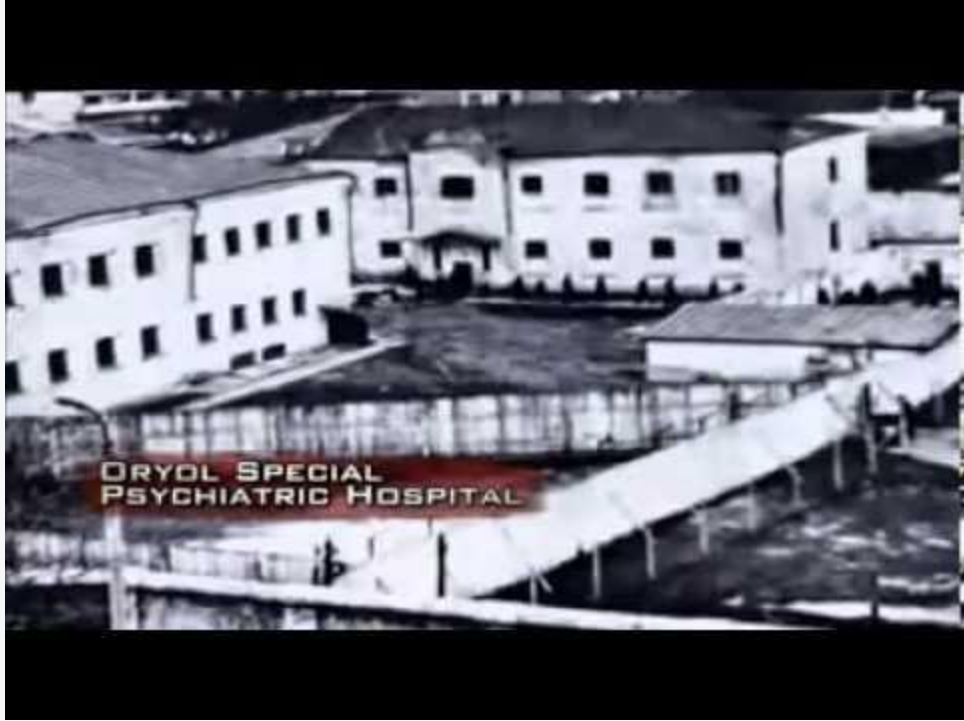
The Most SHOCKING Psychiatry Documentary EVER

June 5 at 1:54am · Like · Remove Preview