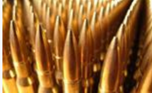
Former Pentagon Official: US preparing for 'insurrection, riots'