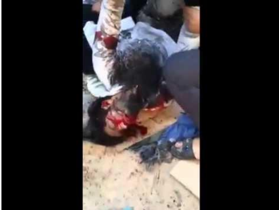
جرائم جماعة داعش في العراق وقتل العرافة بين في الاسواق

June 15 at 11:33pm · Like · Remove Preview