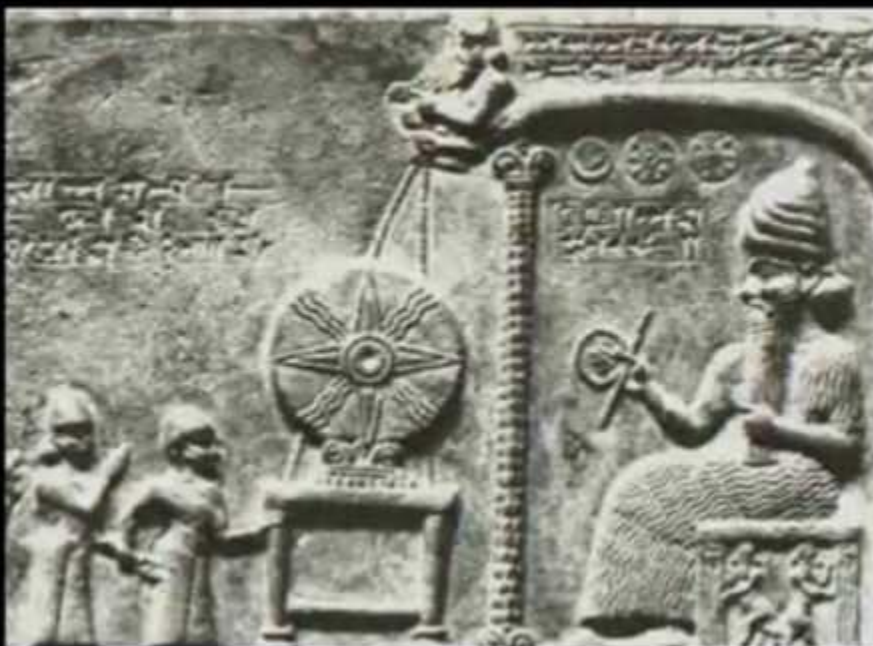
Scariest UFO Documentary Ever! - Conspiritus Remake by Xendrius - Proper / Full Version UFO (devil) Quotes: http://www.poweroftheair.com/quotes.htm Video by Xendrius: h... See More

Michael Swenson https://www.youtube.com/watch?v=uOx3Zdl4738