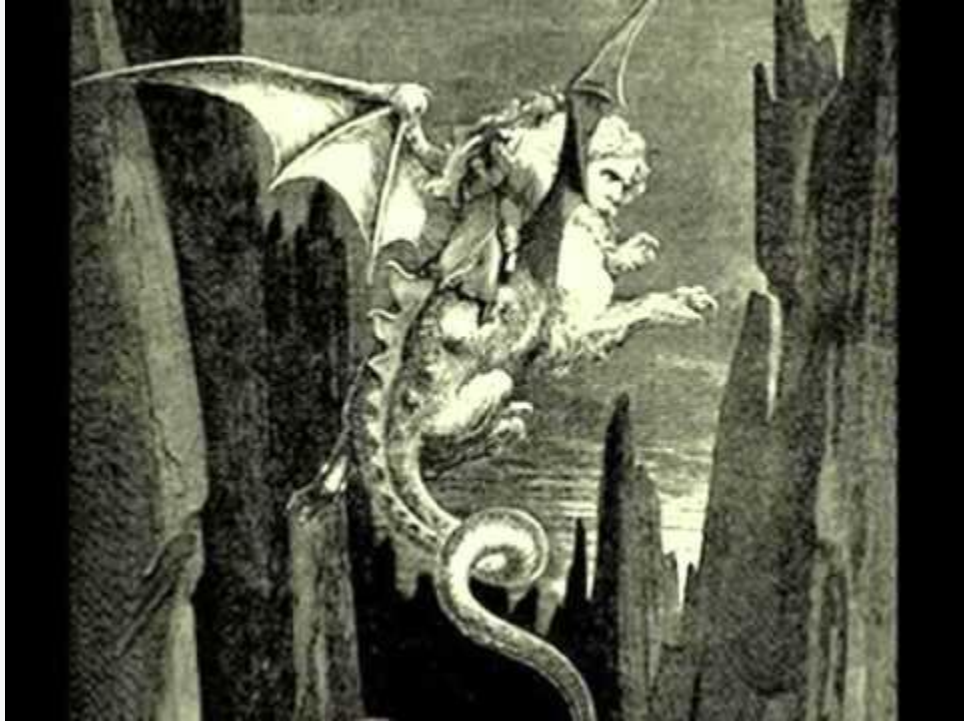
There were GIANTS on the EARTH. 2014 ANCIENT GIANT DOCUMENTARY by WOLVOMAN80 DOWNLOAD LINKS http://wolvoman80.blogspot.co.uk/2014/03/downloads-dvds-and-books... See More

June 15 at 2:38am · Like · Remove Preview