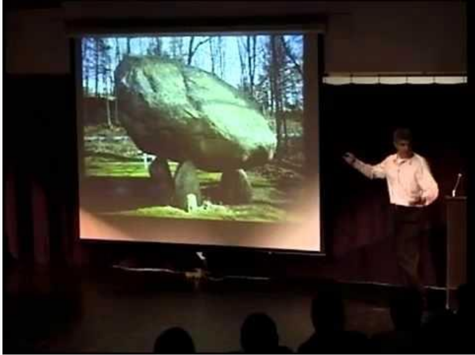
Mysterious Stone Chambers & Giants Discovered in New England- Jim Vieira Strange stone tunnels and chambers, perhaps pre-historic, have been found in Ley... See More

June 15 at 2:23am · Like · Remove Preview