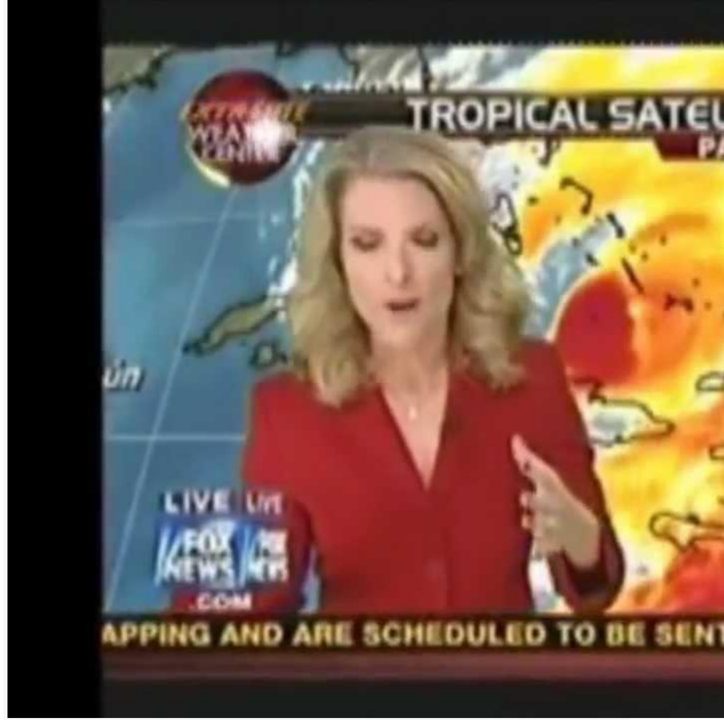
WATCH NOW "IN A NUTSHELL" if this doesn't scare you into reality, I don't know what will !!! Note: Daretoshare has moved to another channel Therealtruthseeker. To see my new...See More

April 2 at 8:15pm · Like · Remove Preview