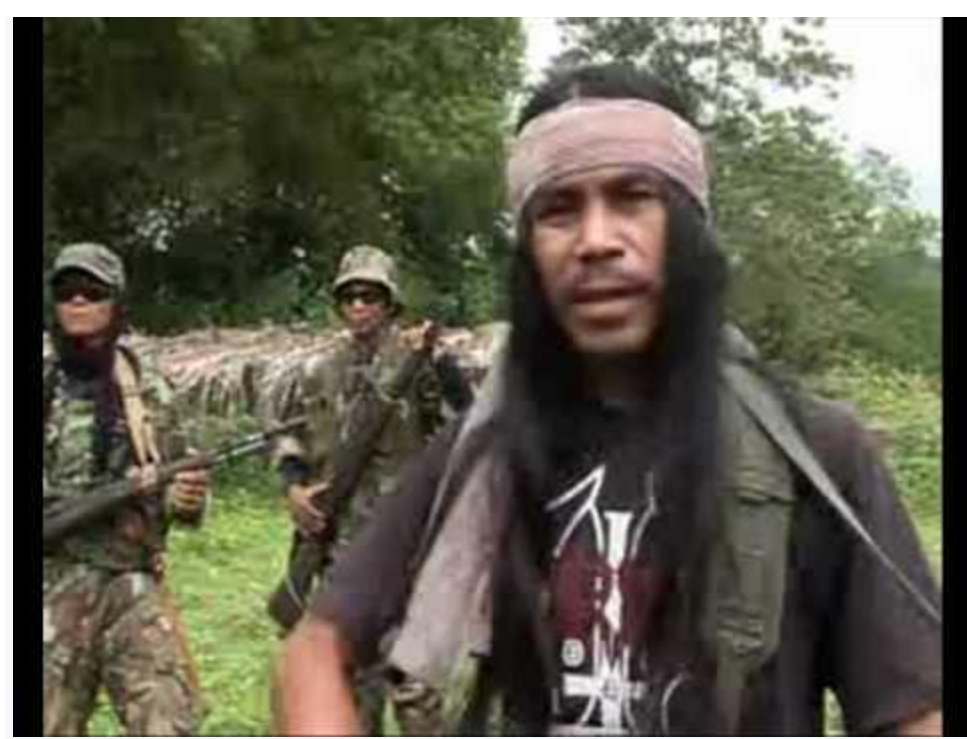
'God's Army' - Filipino Christian Militias Fighting Back Against the Islamists To help combat the barbaric Moro Islamic Liberation Front in the Southern Philli...See More March 23 at 11:40am · Like · Remove Preview