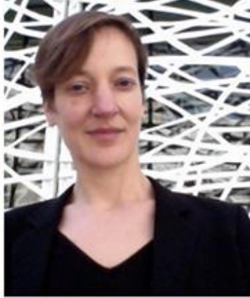
Radical anti-Israel activist Grietje Baars wrote it.

The incredible story exposed today for the first time by UN Watch.