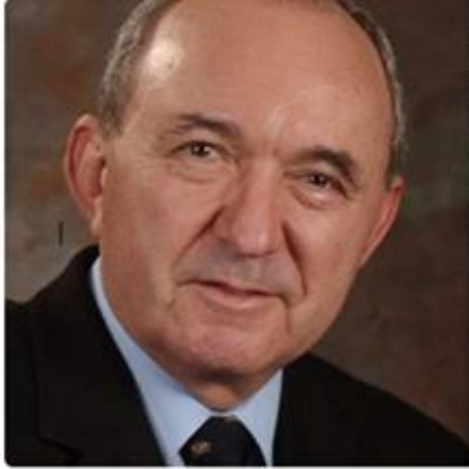
Goldstone the Jew was the face of the Goldstone Report.