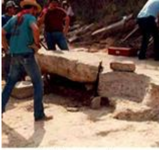
Careful elevating procedures

The Paluxy fossil human footprints - Genesis Week, special episode #33, season 2 Ian Juby Wazooloo